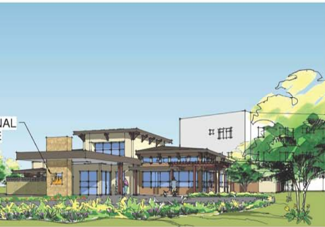
VIEW OF THE SOUTH ELEVATION AND MAIN ENTRANCE