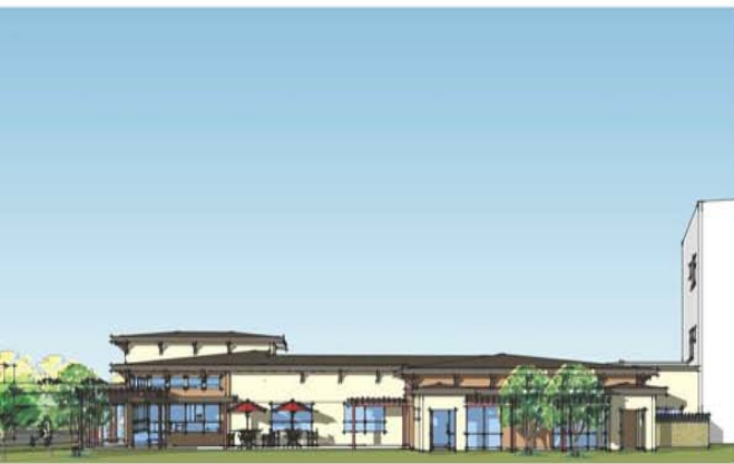
VIEW OF THE EAST ELEVATION